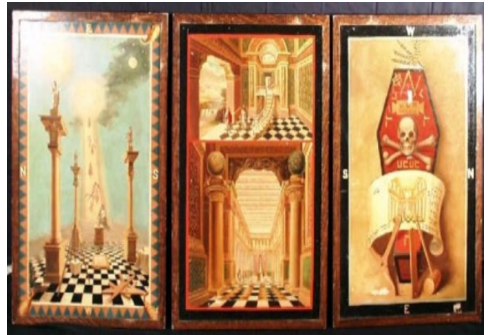
Masonic racing boards used for teaching the different degrees. (Provincial G. L. of Middlesex)